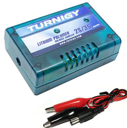
Figure 8: Turnigy Lithium Polymer Balance Charger