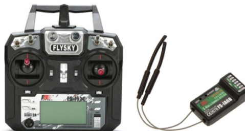
Figure 2: Flysky FS-i6X 2.4GHz 10CH Upgrade Flysky i6 AFHDS 2A RC Transmitter TX with iA6B Receiver