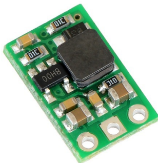
Figure 7: Pololu 12V Step-Up Voltage Regulator U3V12F12