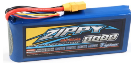
Figure 6: ZIPPY Flightmax 8000mAh 3S1P 30C Lipo Pack with XT90