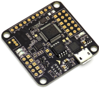
Figure 3: USAQ Naze32 Flight Controller for Racing Drones Acro 6DOF Rev.6