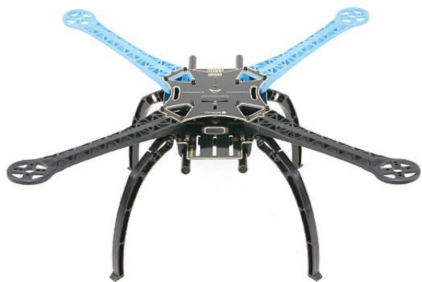
Figure 1: S500 Glass Fiber Quadcopter Frame 480mm - Integrated PCB Version