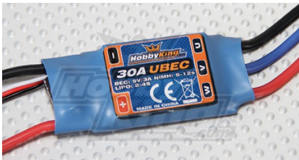
Figure 5: HobbyKing 30A ESC 3A UBEC