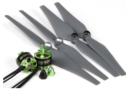
Figure 4: MultiStar 350 to 450 Frame Size 2212 Combo Set With Self-Tightening Propellers CW/CCW Set Of 2